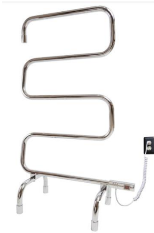
Sapphire Model FSPHR05