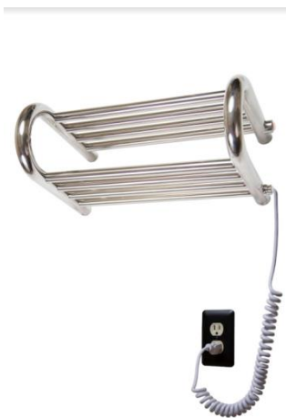
Emerald Model WERD01